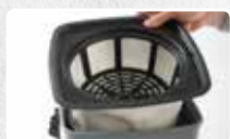
CARTRIDGE FILTER AND POLYESTER FILTER