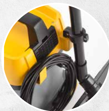
NEW ACCESSORIES AND CABLE HOLDER

TRIPLE FILTERING SYSTEM PAPER FILTER BAG + TEXTILE OR CARTRIDGE FILTER + EXHAUST AIR FILTER