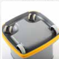
CHASSIS WITH CASTORS