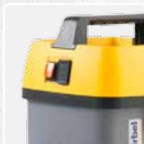
POSSIBILITY TO CONNECT TO THE ELECTRIC POWER BRUSH