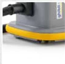
NON-MARKING RUBBER ANTI-SHOCK BUMPER