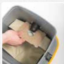
ECOLOGICAL PAPER FILTER BAG