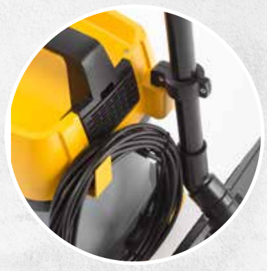
NEW ACCESSORIES AND CABLE HOLDER

PAPER FILTER BAG + TEXTILE OR CARTRIDGE FILTER + EXHAUST AIR FILTER