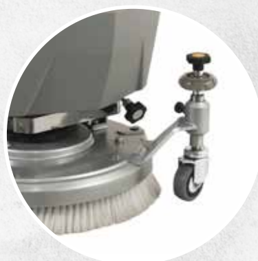
PERFECT ADJUSTMENT OF THE HEAD