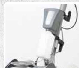
SPRAY ELECTRIC SYSTEM