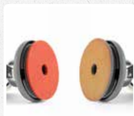
VARIOUS TYPES OF PADS