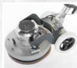
STURDY AND COMPACT FRAME