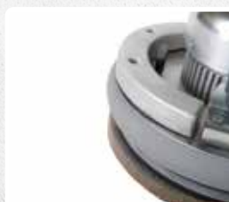
POSSIBILITY TO USE ADDITIONAL WEIGHT