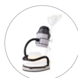
Suction kit (optional)