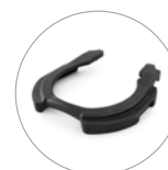
Possibility of additional weight use (optional)