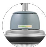
27% recycled plastic