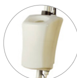
Tank 12 l (optional)