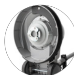
Mount for drive board and brushes